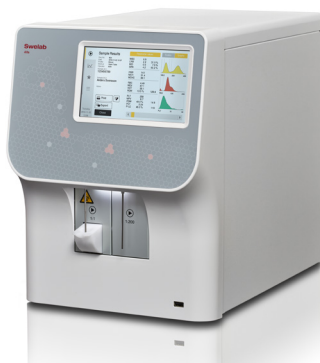
Swelab Alfa Plus Basic – even the basic model includes shear-valve technology.

Multiple models for all laboratory needs including unique 'walk-away' autosampler