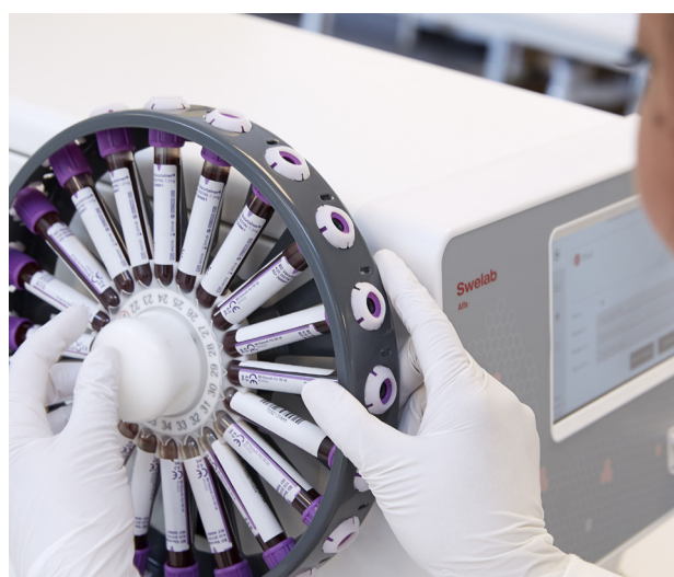
Pre-load up to 2 x 20 samples and let Swelab Alfa Plus Sampler do the work.