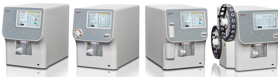
Swelab Alfa Plus Basic Swelab Alfa Plus Standard Swelab Alfa Plus Cap Swelab Alfa Plus Sampler

QC software: Yes, including Levey-Jennings and Xb Memory capacity: 50,000 samples Display: 7 inch WVGA true color (24-bit) touch screen Interface ports: 1 USB device/4 USB host/1 LAN port