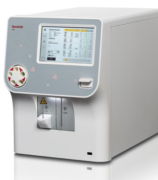
Swelab Alfa Plus Standard – five-sample mixer is ideal for doctors' offices and small labs.