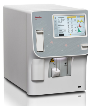
Swelab Alfa Plus Cap – closed-tube sampling minimizes risks from contaminated blood.