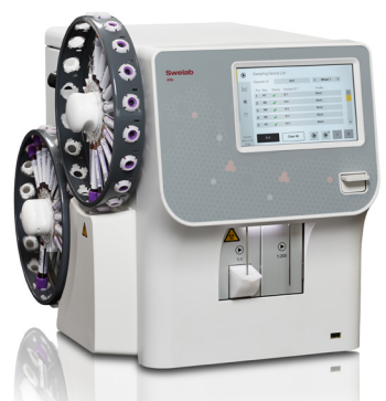
Swelab Alfa Plus Sampler – for up to 2 x 20 samples. Just load and walk away.