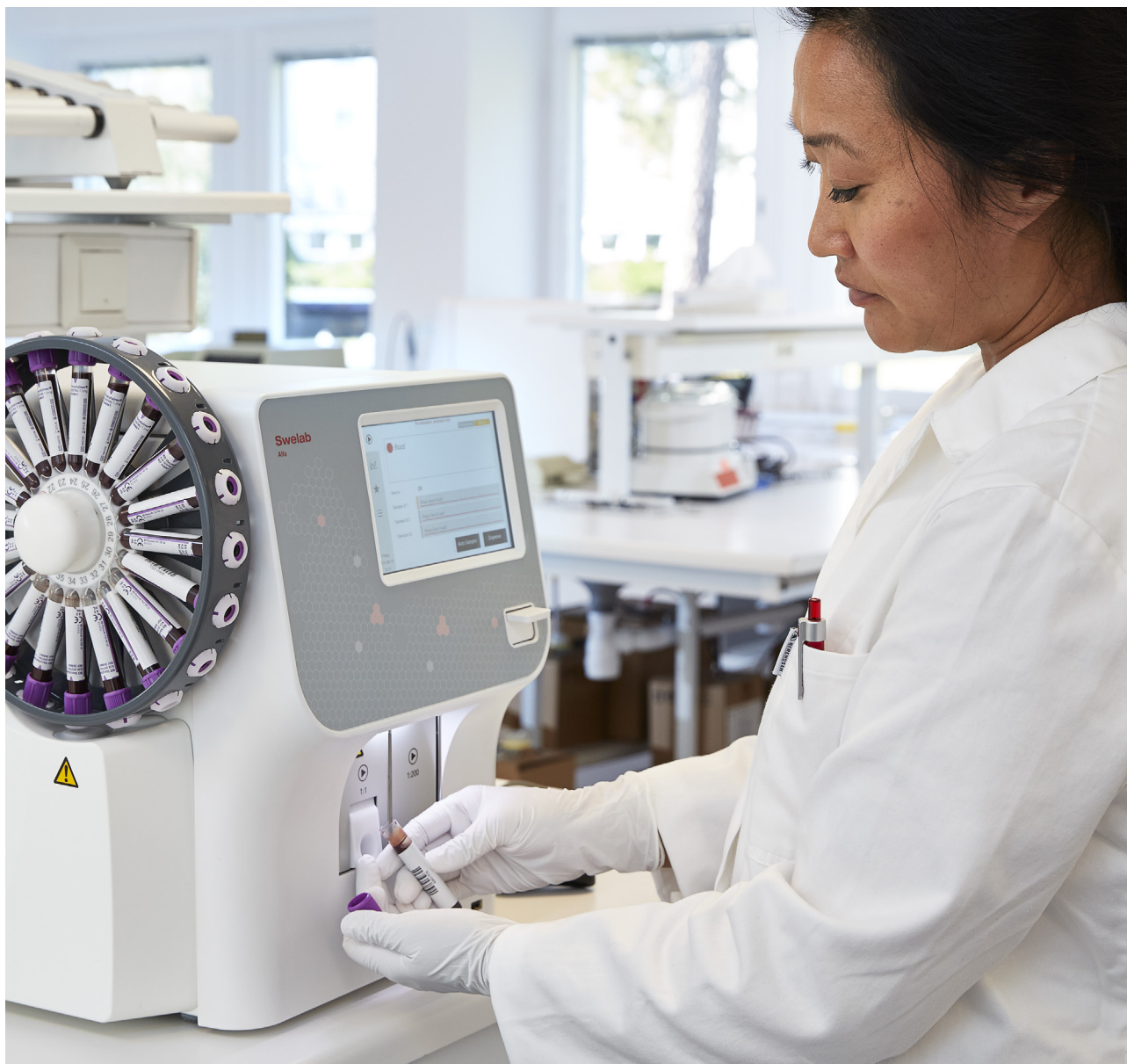
Swelab Alfa Plus Sampler is ideal for small to medium-sized hospitals needing walk-away analysis functionality.