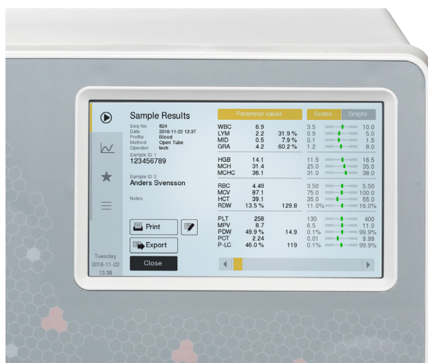
Modern user-interface. Its clean, uncluttered design promotes efficient operation and accurate assessment of results.